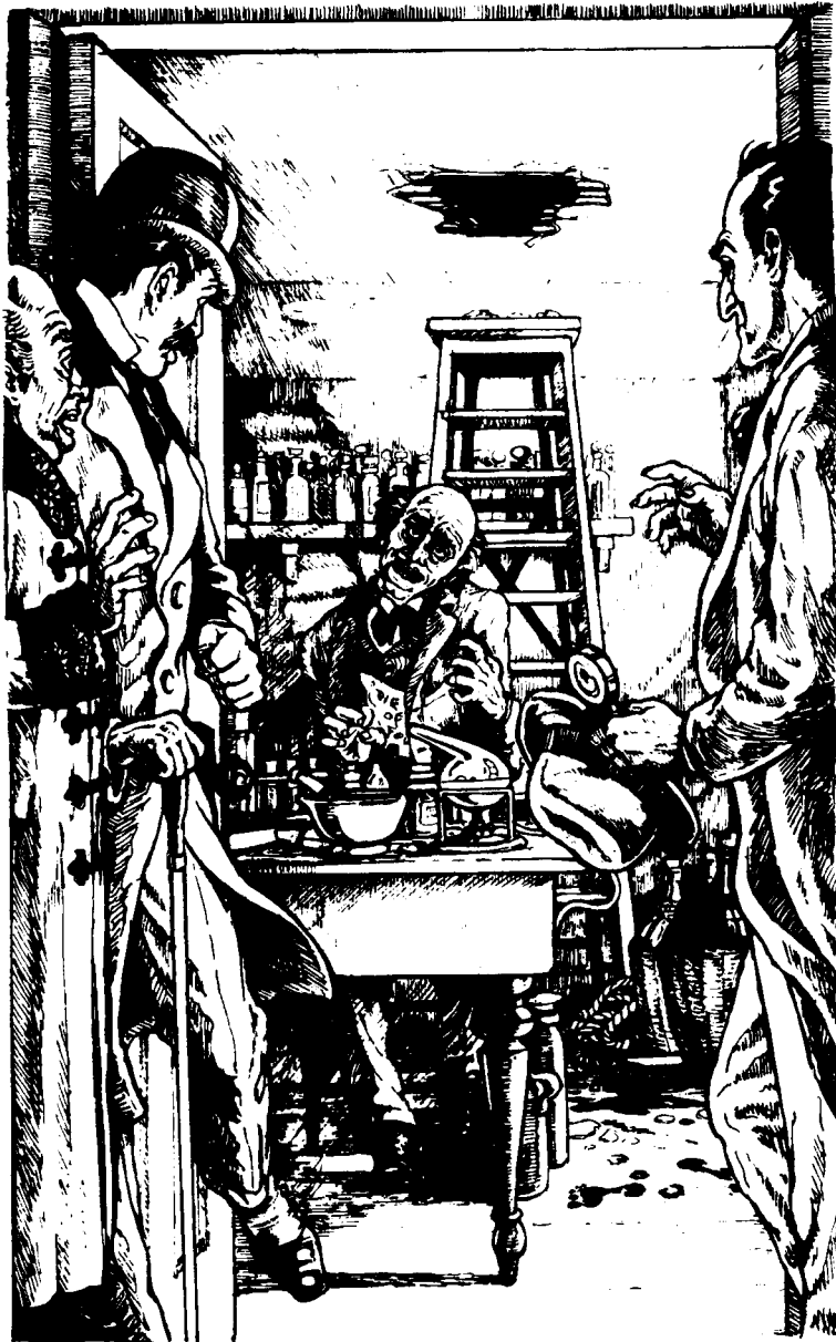
The dead man's body was twisted with pain.

'It was ten o'clock. And now my brother, Bartholomew, is dead and the Great Agra Treasure has gone!'