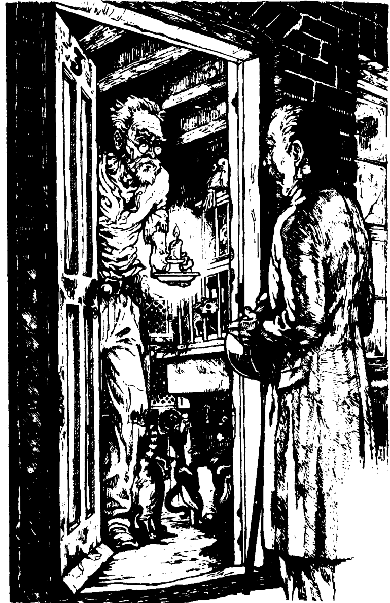
I saw an old man with grey hair and a beard, holding a candle in his hand.

I went into the small dirty house and stopped in astonishment. There were cages everywhere I looked. All the cages contained