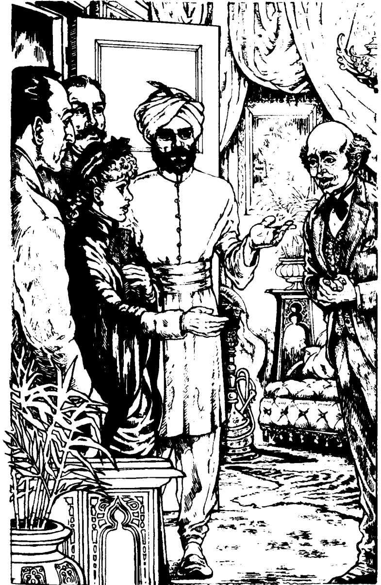
'My name,' said the bald-headed man, 'is Thaddeus Sholto.'

'A doctor!' cried Thaddeus Sholto excitedly. 'Oh, please could you listen to my heart? I am very worried about my heart.' I listened to his heart beating. But I could hear nothing wrong